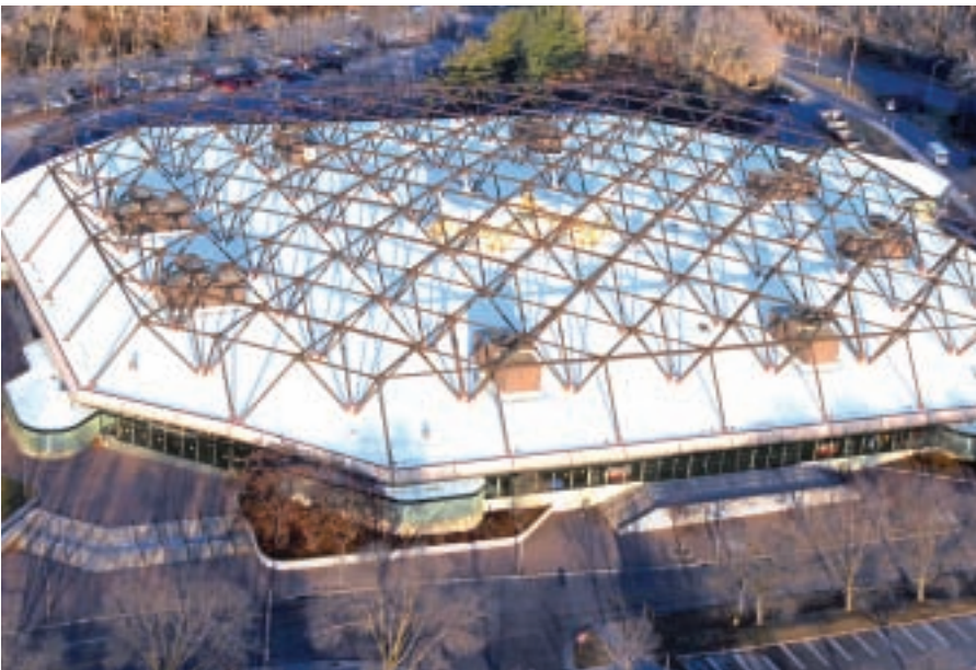
The roof systems of the Boston Marriott® Long Wharf hotel (above) and University of Iowa's Carver Hawkeye Arena (below) were recycled.

21-year-old PVC membrane was still performing well, having retained more than 70 percent of its original plasticizer content. However, in light of the extent of the masonry work to be done and the likely damage that would have occurred on the existing membrane and flashings, it was decided it would be prudent and cost-effective to replace the roof system in conjunction with the masonry and flashing work.